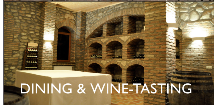
DINING & WINE-TASTING